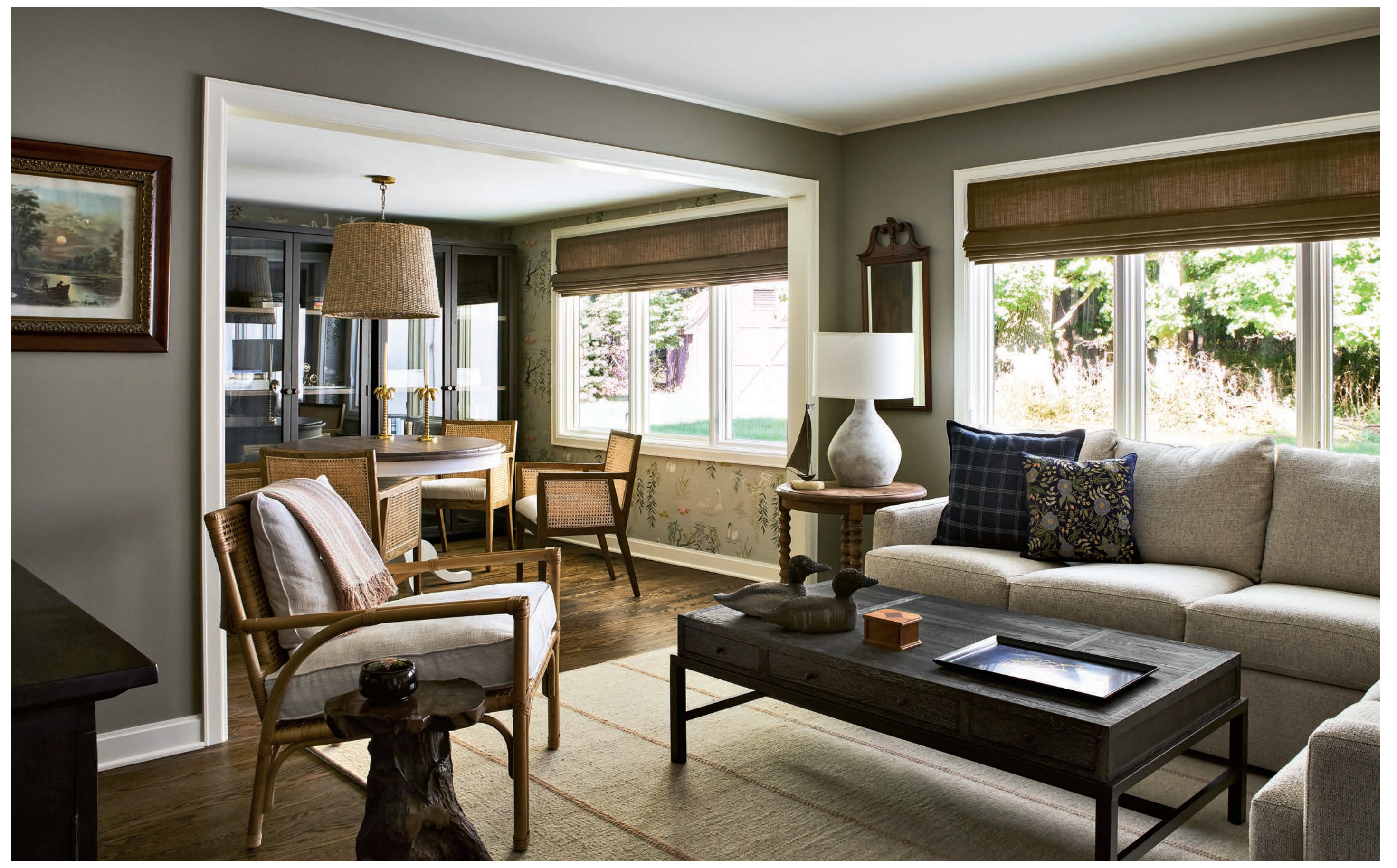
Natural materials star in the family room: rattan on a Universal Furniture armchair, woven fabric on the Sherrill Furniture sectional and oak on a Dovetail coffee table. The adjacent lounge features Osborne & Little's Swan Lake wallcovering.