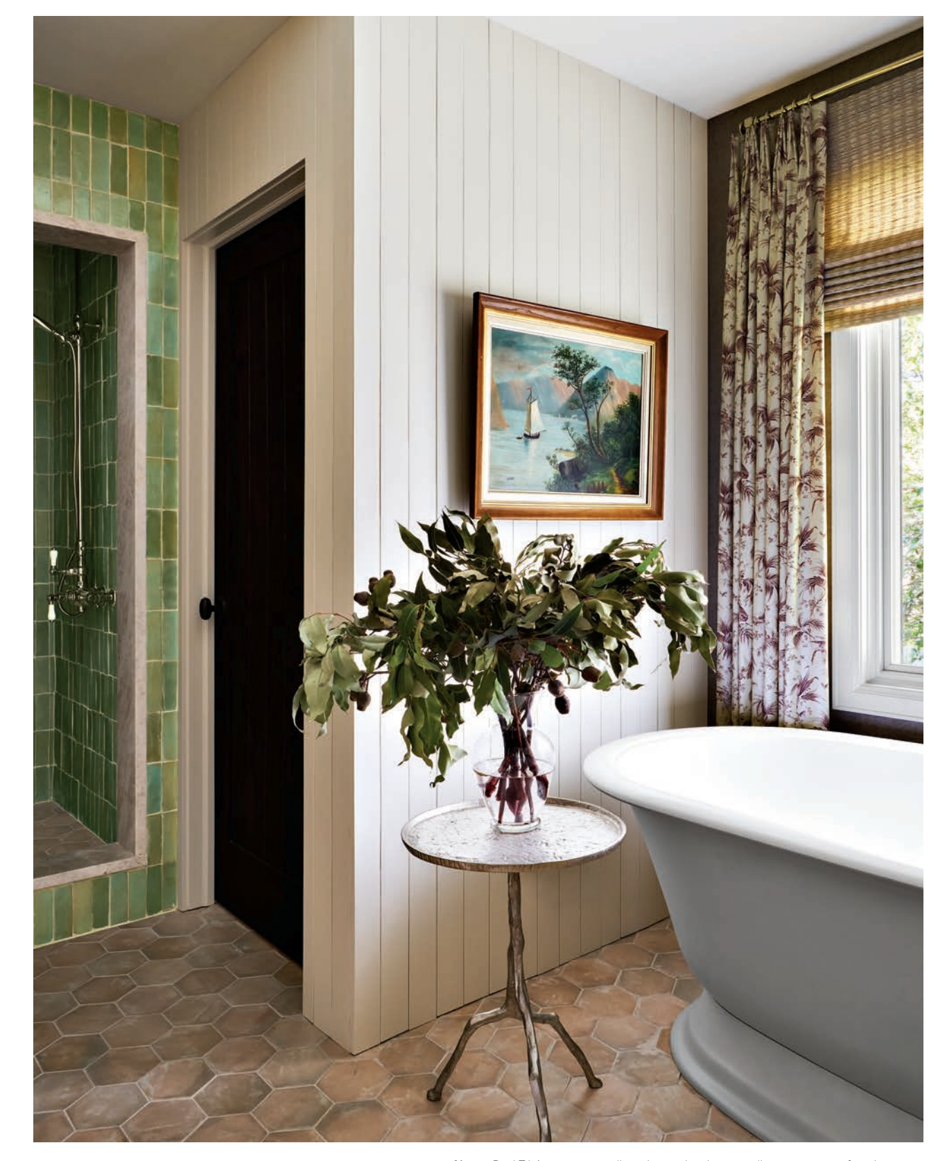
Above: Riad Tile's sea-green zellige tiles on the shower wall inject a sense of verdancy into the primary bath. Draperies in Rose Tarlow Melrose House's Little Bird frame a Victoria + Albert freestanding pedestal tub.