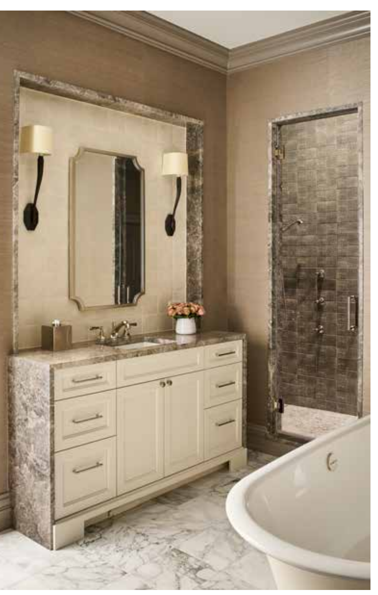
The primary bath's luxe shower package is by Rohl.

See more of this designer's work by visiting online at danrakdesign.com. \blacksquare