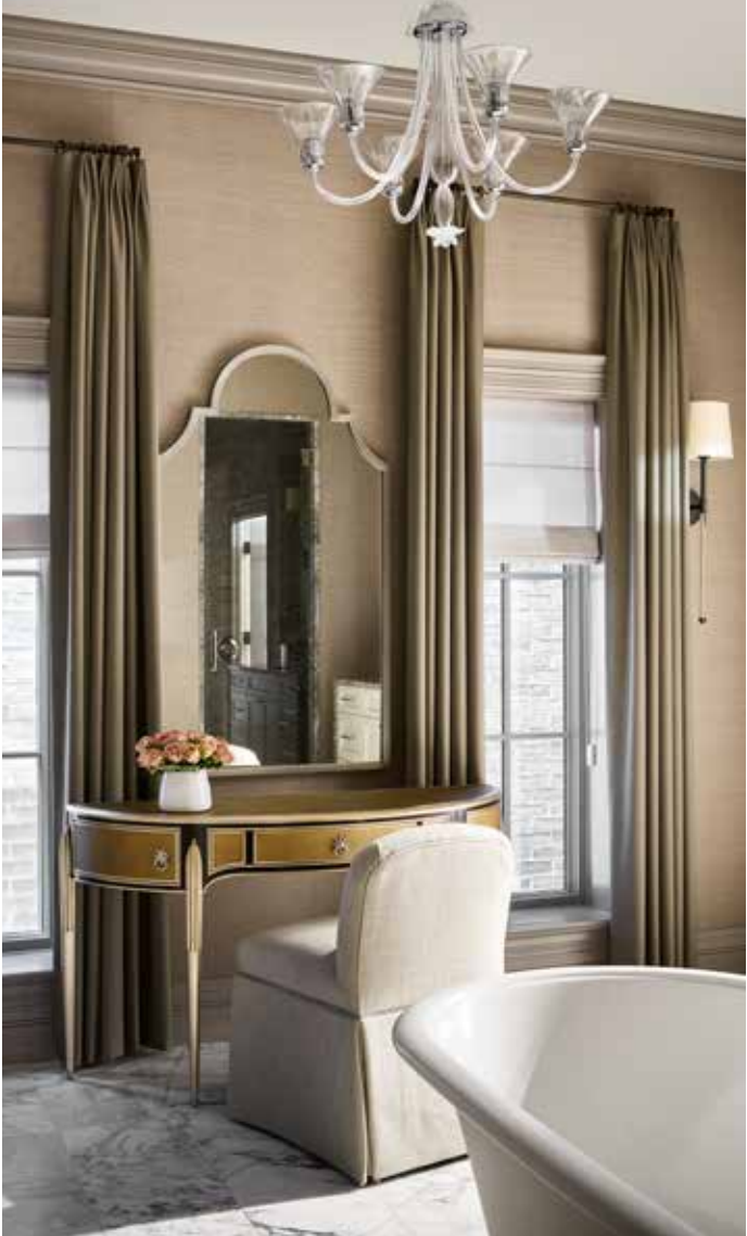
Rohl also provided the vanity fixtures and tub filler.